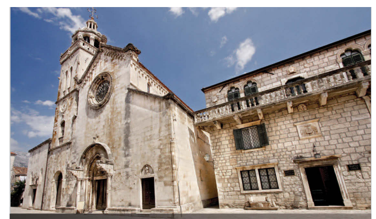
St. Marks Cathedral in Korcula showcases Gothic-Renaissance architecture