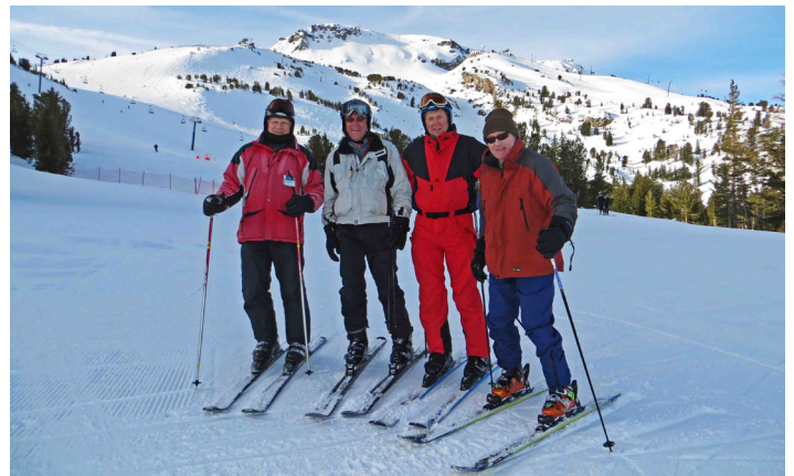
The boys enjoying a sunny day, good snow and no wind.