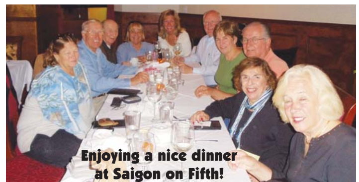
Enjoying a nice dinner at Saigon on Fifth!