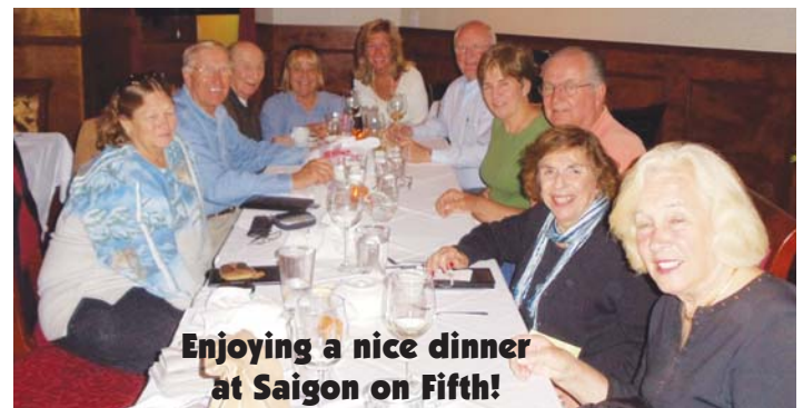
Enjoying a nice dinner at Saigon on Fifth!