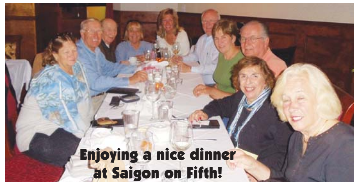
Enjoying a nice dinner at Saigon on Fifth!