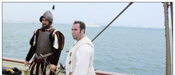
Cabrillo and Soldier