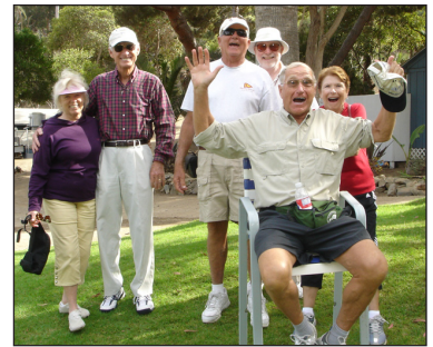
Having fun in Catalina