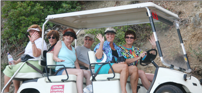
A group that rented a cart to tour the Island