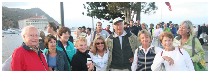
Getting ready to board the boat to come home