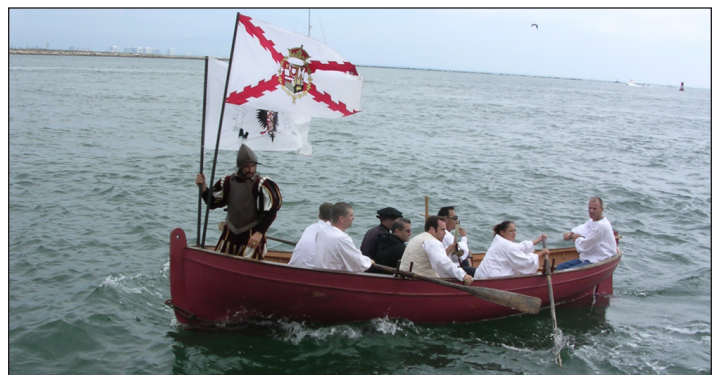
Cabrillo and Landing Crew in the Chalupa