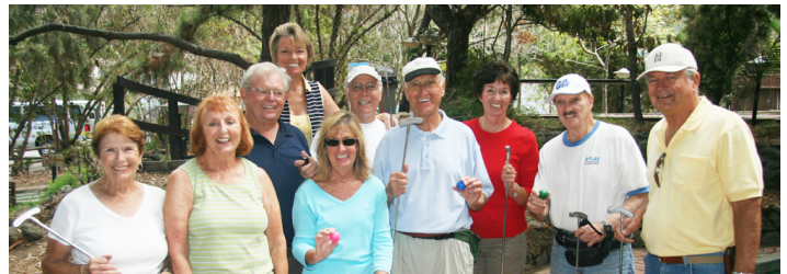
Miniature Golf in Catalina