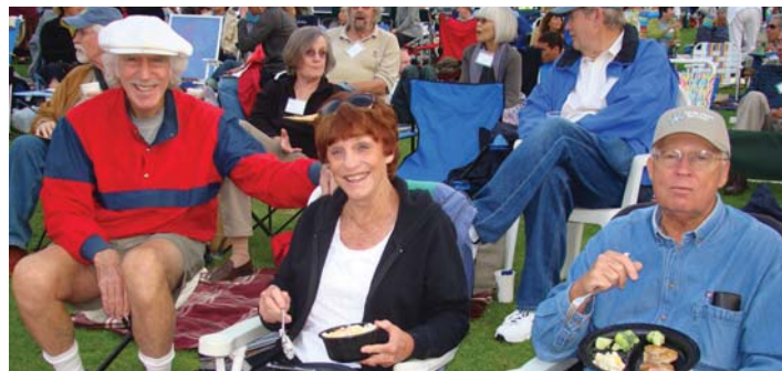
Fun at LJ Summerfest Concert!