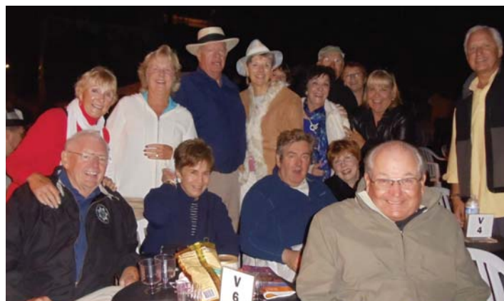
Enjoying Summer Pops Concert!