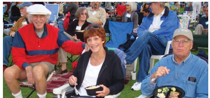
Fun at LJ Summerfest Concert!