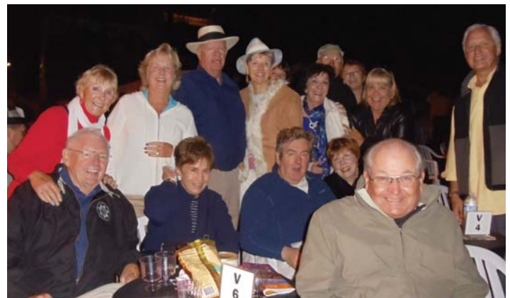
Enjoying Summer Pops Concert!