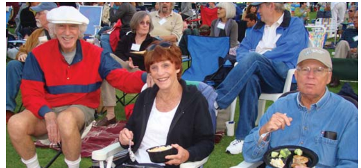
Fun at LJ Summerfest Concert!